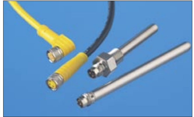
Industrial Grade Temperature Sensors

ATP types TS and TX are ruggedized probes that seal the sensing element from the outside environment. Because they include industry standard cordsets and connectors they are extremely easy to use. The sealed end design adds an extra level of moisture resistance over previous designs. These products simplify the installation and connection of temperature sensors in the harshest applications where the protection of the sensing element from the environment is critical. With this new design, it is now possible to have a fully enclosed sensor that will provide a lifetime of accurate and reliable sensing. Please contact the factory for specific design or application information or the availability of options.