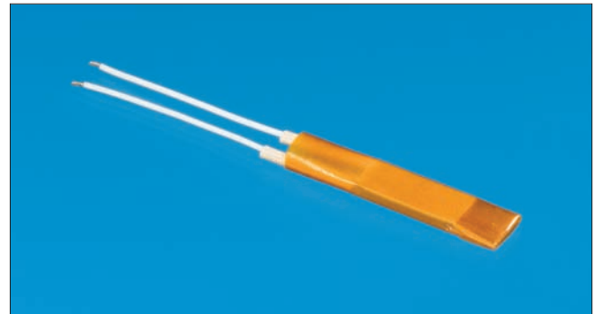
PTC Surface Heater

Please contact the factory to discuss your specific application or to discuss the availability of any options.