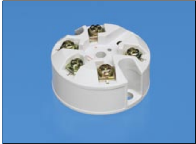
Push Button Temperature Transmitter

A complete data sheet with input and output specifications is available by contacting ATP Engineering.