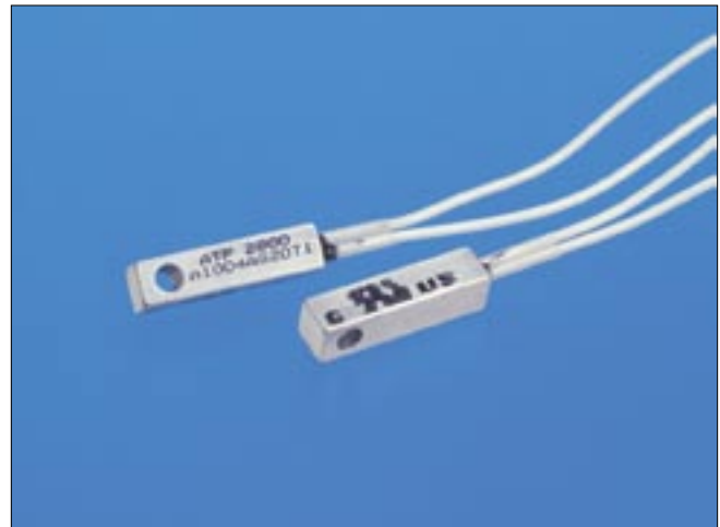
UL Listed Surface Temperature Sensor

ATP assembly A1004AS20T1 is a general purpose thermistor probe for temperature sensing and is listed with Underwriters Laboratories (Certification file E193945). This sensor can be used to monitor air temperature or can be screw mounted for surface temperature measurement. The assembly consists of a highly stable NTC thermistor that is epoxied into an aluminum housing. The thermistor is a 10k\Omega thermistor with an accuracy of \pm 0.2^\circ\text{C} from 0^\circ\text{C} to 70^\circ\text{C} . The sensor leads are AWG#20, teflon insulated UL rated wire. Sleeving is used to provide strain relief and to guarantee the UL rated 400 volt isolation between the sensor and the housing. The assembly is UL rated for operation to 105^\circ\text{C} .